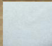
Light Antique Blue