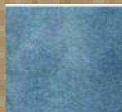
Dark Antique Blue

Look at all the new colors and I have more coming!